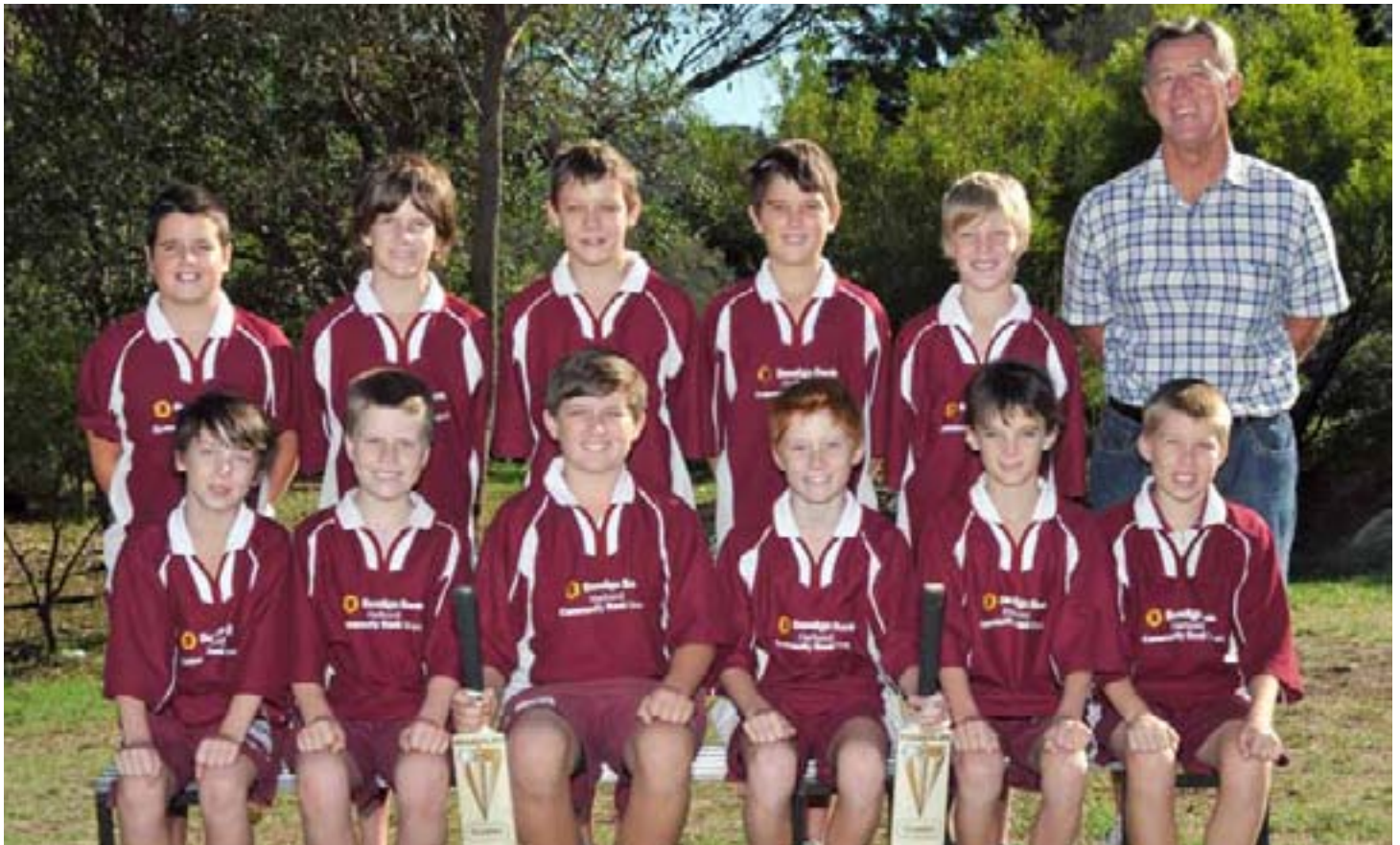
Harbord Public School Boys Senior A Cricket Team 2011