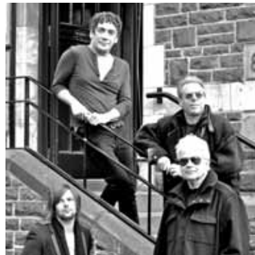
Left: Aussie / Kiwi rock icons Dragon headline the beach festival.

To purchase tickets for the VIP area, become a sponsor or donate prizes towards the raffle, please contact Debbie Austin at debbie.austin@linkmarketservices.com.au .