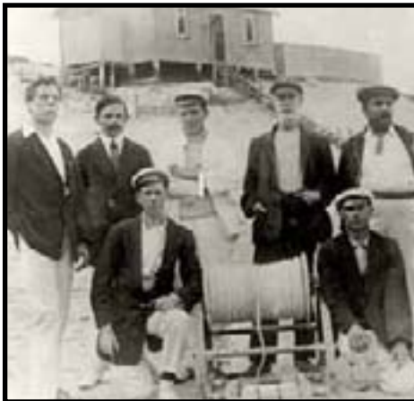
Freshwater history showcased in photo competition