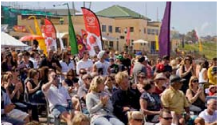
Below: 2009 Curly Sound Waves and awesome weather saw a big crowd turn out on the day.