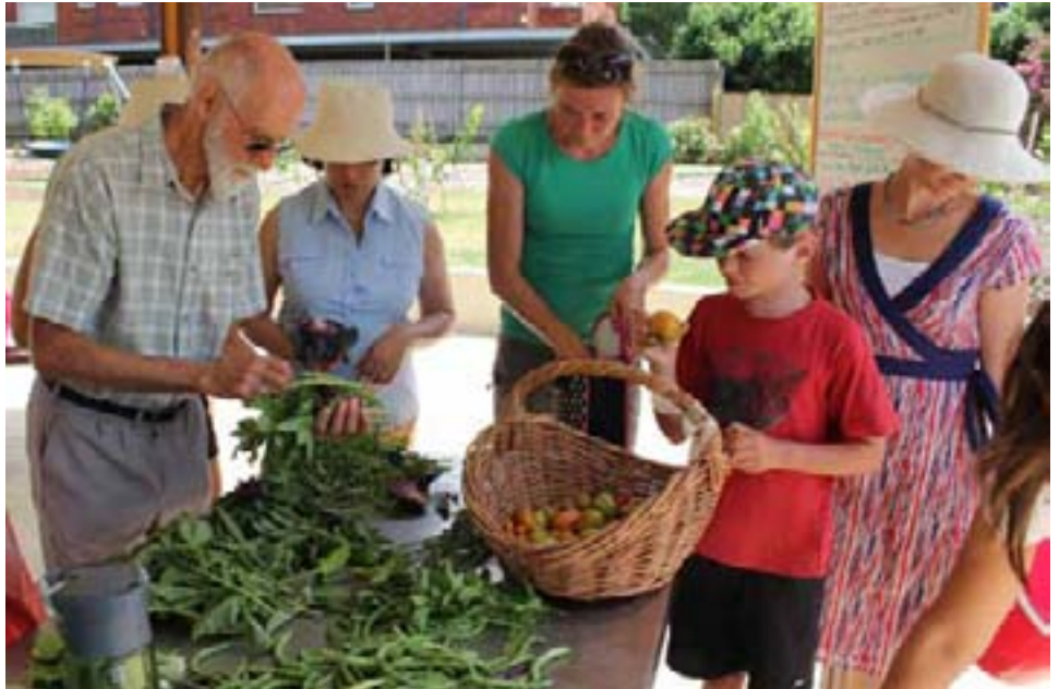
Community Garden volunteers share harvested produce with locals

Other recent visitors to the garden included 62 excited Year 4 students from St Kieran’s Catholic School. With a personalised tour, they saw examples of permaculture, companion planting, organic pest control, plant diversity and seed saving.