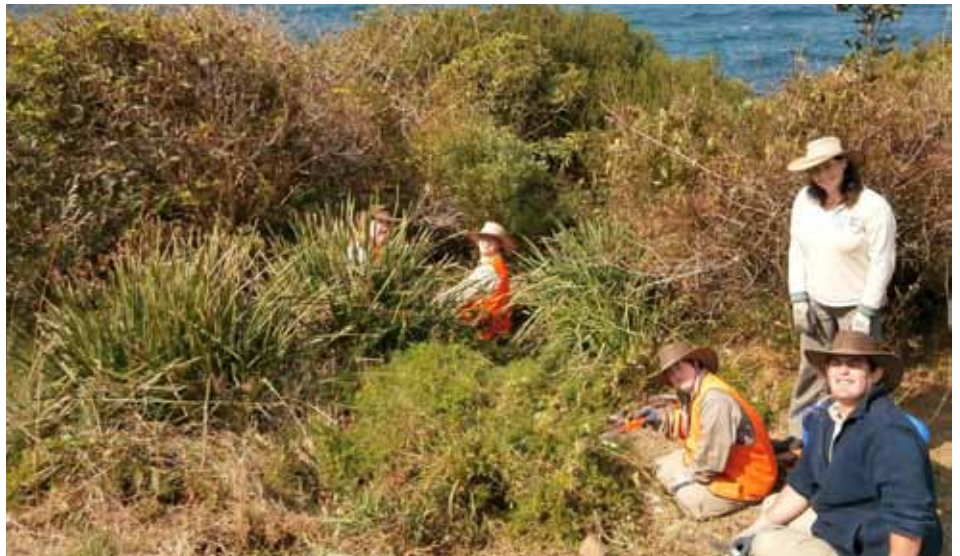
Bushlink Team have been working on the Curl Curl coast scrubland