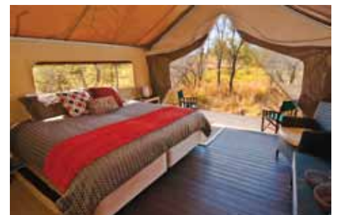
Bungle Bungle Wilderness Lodge, The Kimberleys, Western Australia