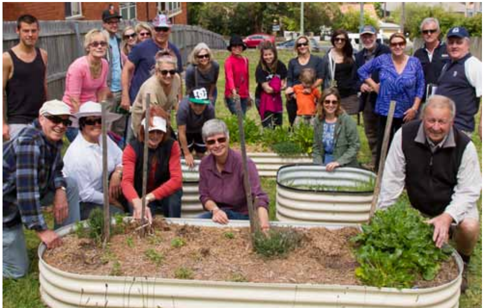
Freshwater Community Gardens is taking shape

In 2011, following in the footsteps of Manly Vale Community Garden, and assisted by its committee, Friends of Freshwater established a modest two-bin demonstration garden on vacant land at Crown Reserve, between Crown and Queenscliff Roads. There were many features of this site including location within medium density housing; it already had an existing playground, which would be