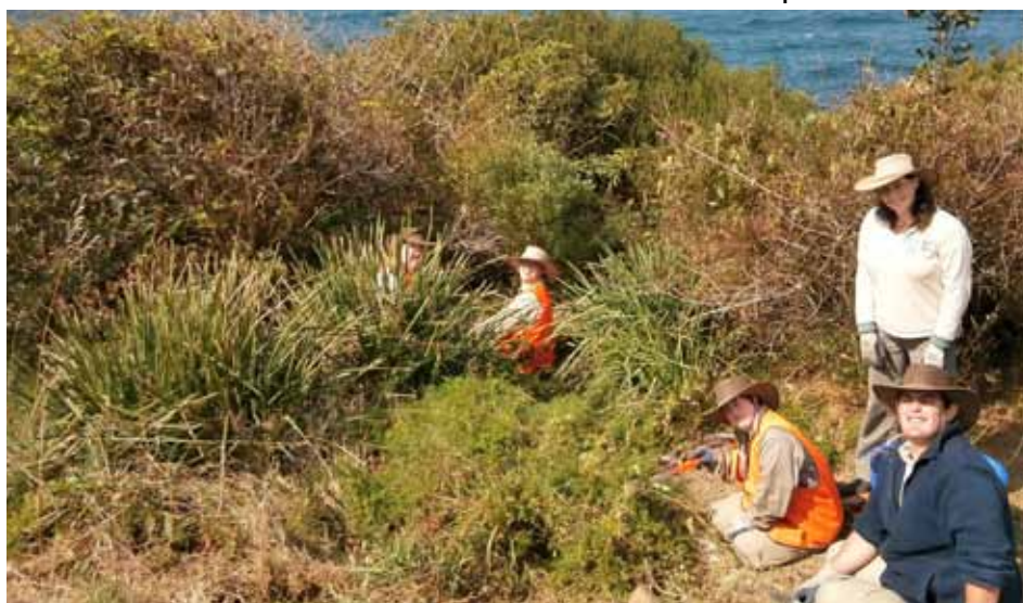
Bushlink Team have been working on the Curl Curl coast scrubland