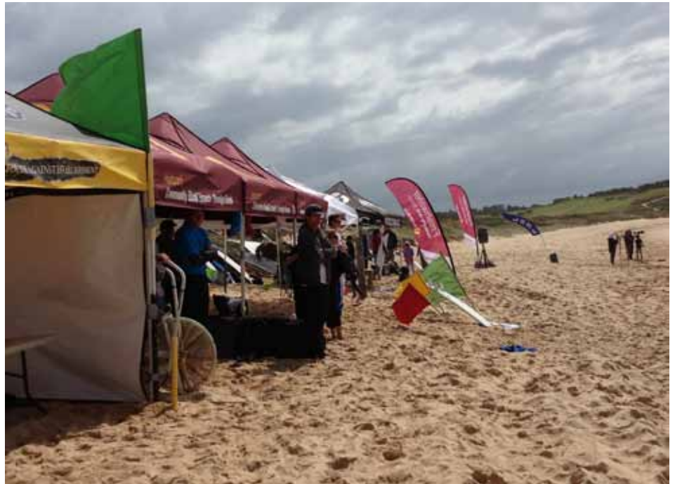
Another day out in God's Country

the opportunity to blood a young team with a number of Groms aged from 8 years of age up, following a late withdrawal of one of the other teams. They didn't progress far but importantly had a lot of fun.