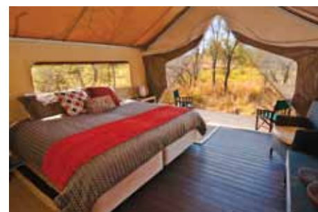
Bungle Bungle Wilderness Lodge, The Kimberleys, Western Australia