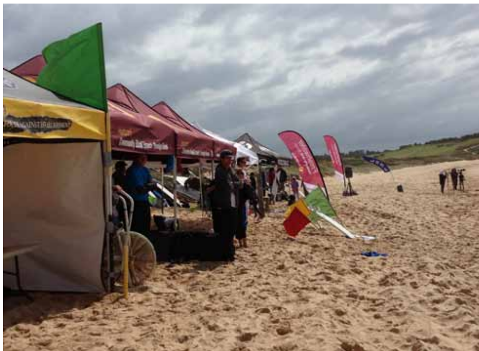
Another day out in God's Country

the opportunity to blood a young team with a number of Groms aged from 8 years of age up, following a late withdrawal of one of the other teams. They didn't progress far but importantly had a lot of fun.